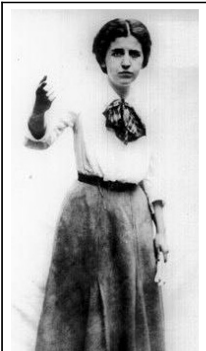
Elizabeth Gurley Flynn, one of the founding members of the ACLU later became the head of the Communist Party USA.

Can a Communist-like organization that denies the existence of God and seeks political dominion over the whole world properly be called a religion? The answer is a resounding “YES!” Remember that Communism itself is a religion. Here is how the late FBI director J. Edgar Hoover described Communism: